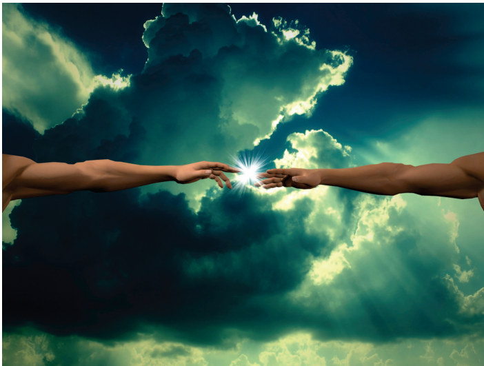
in creating man