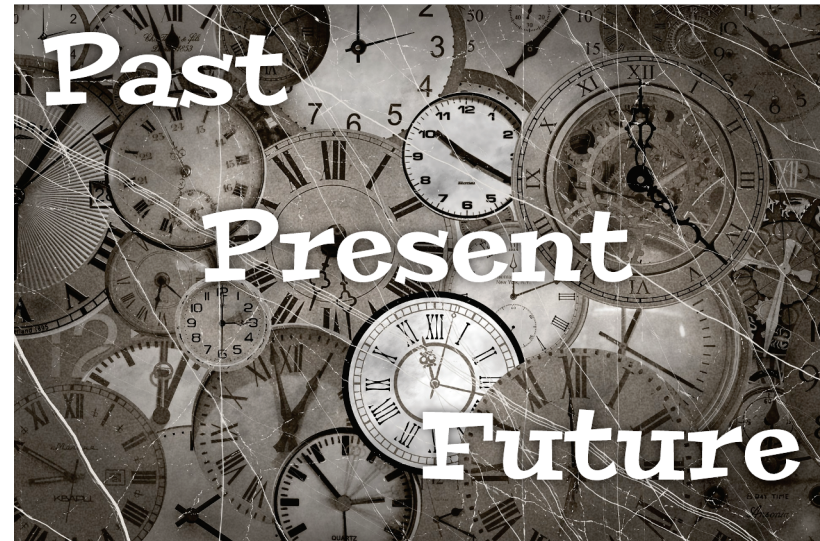
hath been, and will ever be,