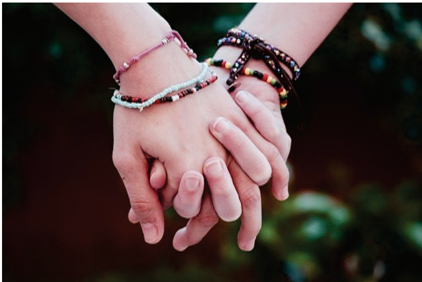
and durable bonds