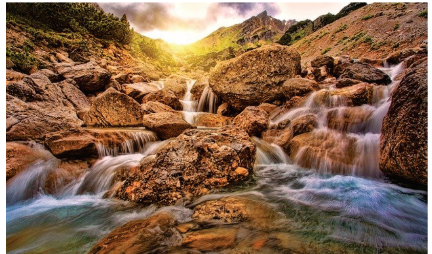
the limpid stream