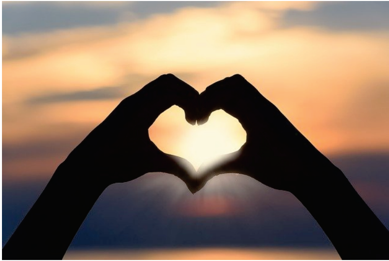
O ye beloved of the Lord!