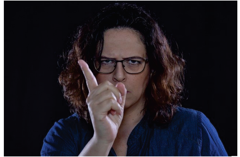
Commit not that