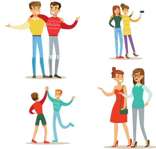
of all men.