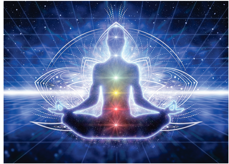
thine own soul,