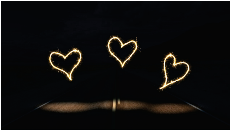
and attract the hearts